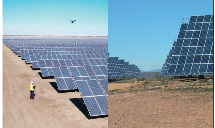
Routine inspections are a critical part of operational efficiency

Incorporating thermal inspections into your routine maintenance plan will reduce your inspection times from weeks to hours when using a UAS solution, and hours to minutes when using a handheld thermal imaging solution. You'll work more safely during inspections by reducing your exposure to the elements, and it will help improve your overall efficiency.