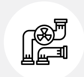
Water, wastewater and sewage