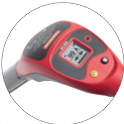
LCD Display with auto backlight to view clearly in bright sunlight