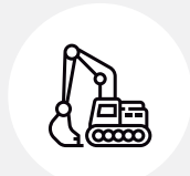
Outdoors facilities maintenance