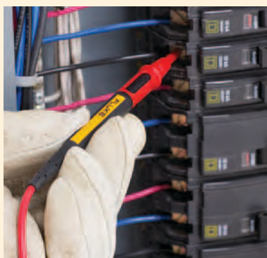
Reduce tip exposure for CAT III testing