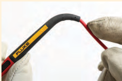
Extreme strain relief tested to withstand over 30,000 bends