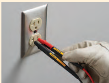
Increase tip exposure for CAT II probing