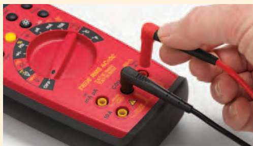
Universal plugs compatible with all 4 mm shrouded inputs