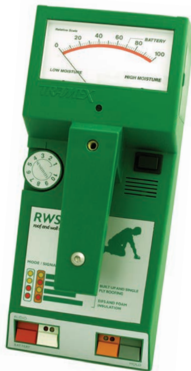
Product order code: RWS

The Tramex RWS is a multi-mode non-invasive impedance moisture scanner designed for the instant, precise and non-destructive evaluation of moisture conditions and leak tracing in the roofing and walls systems of the building envelope.