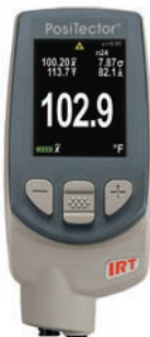
Scanning Statistics Mode