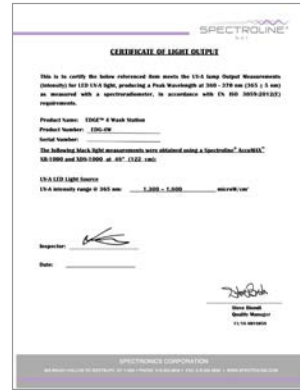
CERTIFICATE OF LIGHT OUTPUT