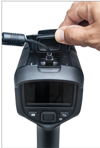
Download images fast via USB

Specifications are subject to change without notice. For the most up-to-date specifications, go to www.flir.com