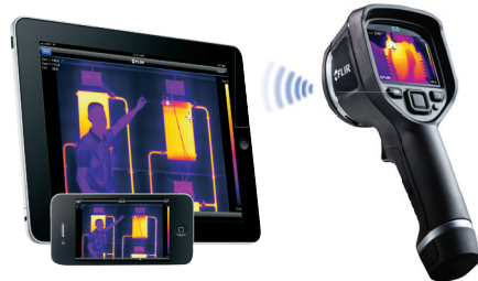
Wireless Connectivity to Smartphones, Tablets and more.

PORTLAND Corporate Headquarters FLIR Systems, Inc. 27700 SW Parkway Ave. Wilsonville, OR 97070 PH: +1 866.477.3687