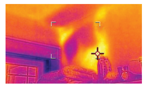
See temperature patterns showing insulation voids and other building issues