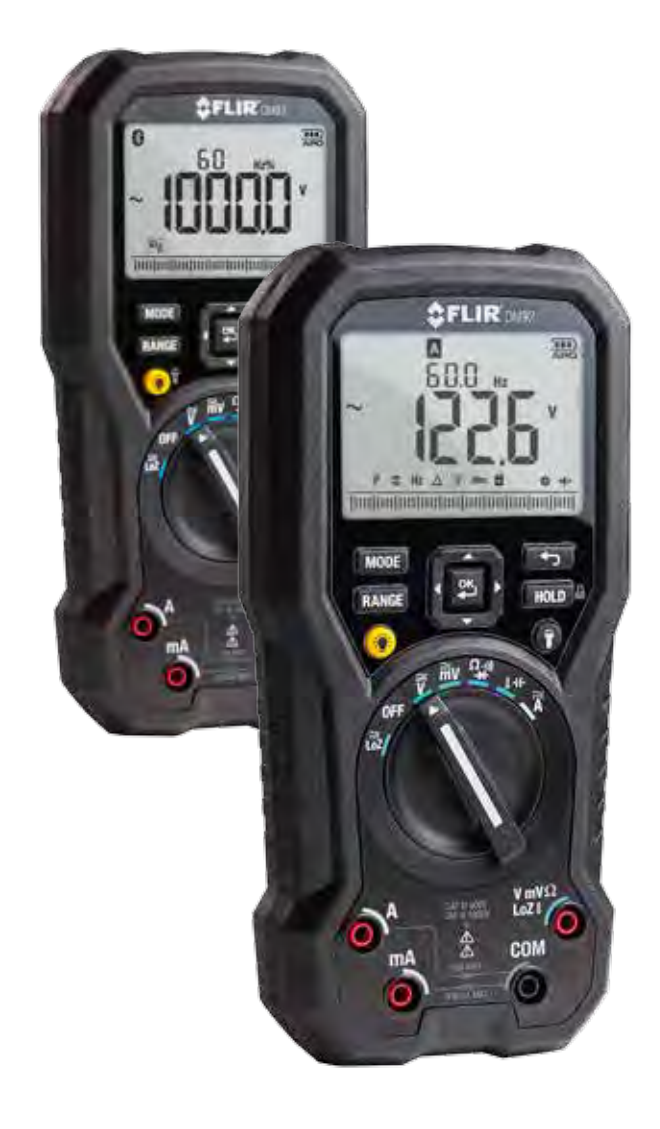
DM92 and DM93 feature powerful LED worklights