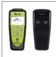
DC580 front and back