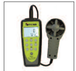
DC580C2 with vane probe