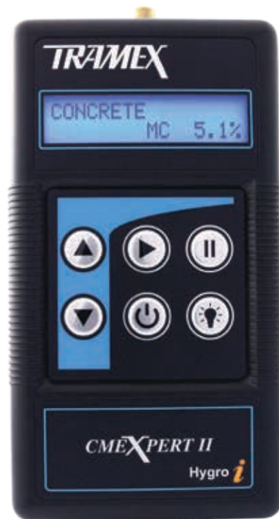
Product order code: CMEX2

For evaluating the moisture conditions of concrete and other slabs and screeds per ASTM F2659 (Non-destructive method) and relative humidity measurement to ASTM F2170 (In situ method) and British Standard 8201, 8203 (Hood Method) with optional Hygro-i® probe.