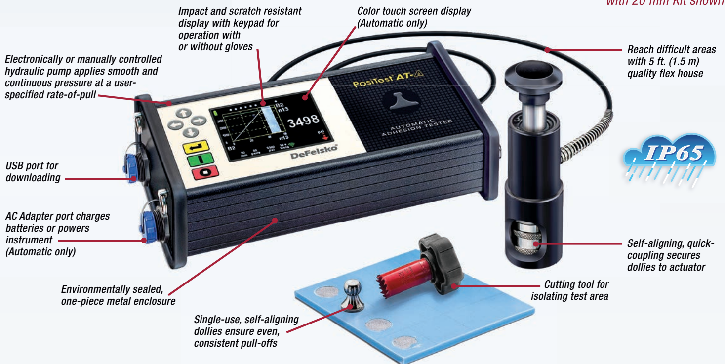
PosiTest AT-A Automatic with 20 mm Kit shown