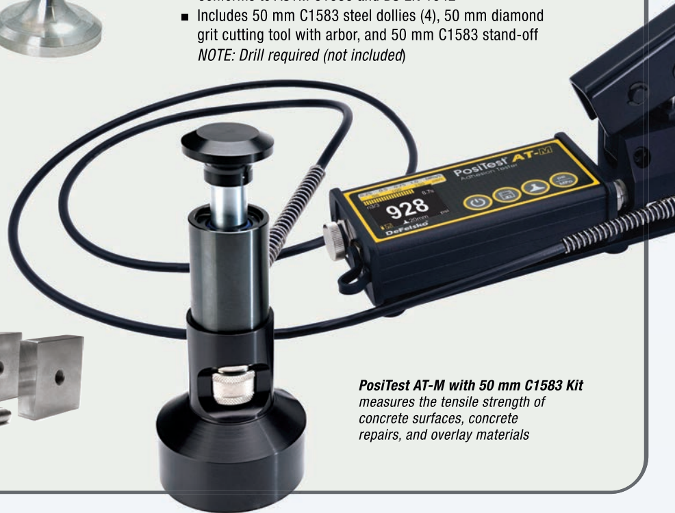
PosiTest AT-M with 50 mm C1583 Kit measures the tensile strength of concrete surfaces, concrete repairs, and overlay materials