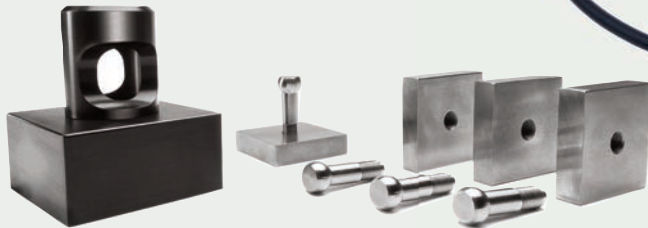
PosiTest AT 50T KIT measures the tensile strength of ceramic tile adhesives.