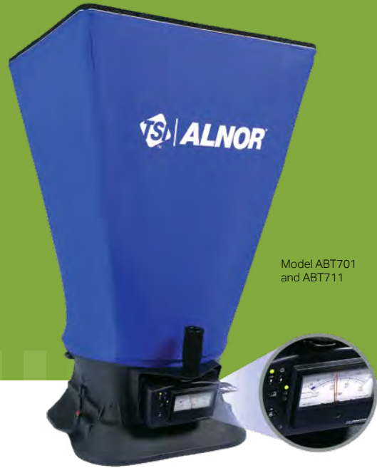
Model ABT701 and ABT711

The ABT Analog Balometer® Capture Hood continues the long Alnor® tradition of providing accurate and dependable analog instrumentation to the ventilation testing and balancing community.