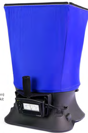
ABT Shown with optional 16 in x 16 in (406mm x 406mm) hood and frame kit (p/n 801209)