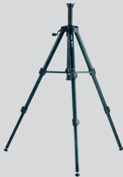
Leica TRI 70 tripod Art. No. 794 963