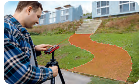
Measuring points and areas