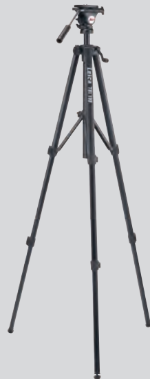
Leica TRI 100 tripod Art. No. 757 938