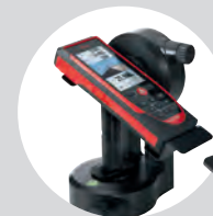
Leica FTA360-S adapter Art. No. 828 414