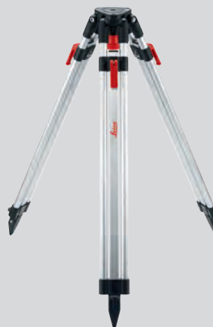
Leica TRI 200 tripod with 1/4" thread Art. No. 828 426