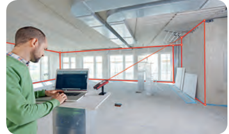
Real-time transfer of point coordinates