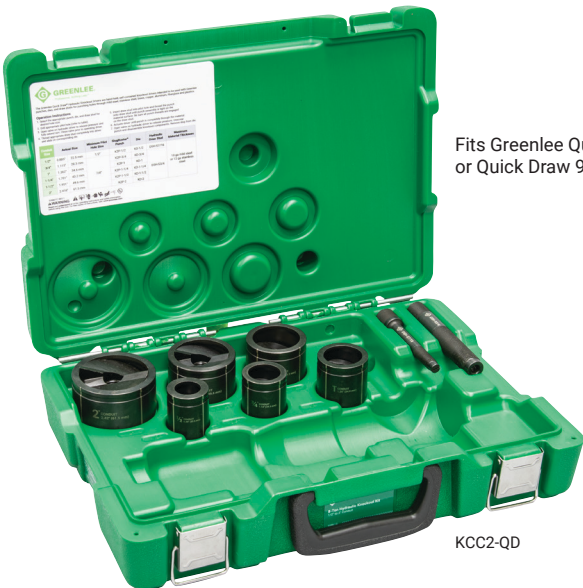
Fits Greenlee Quick Draw® or Quick Draw 90° Driver