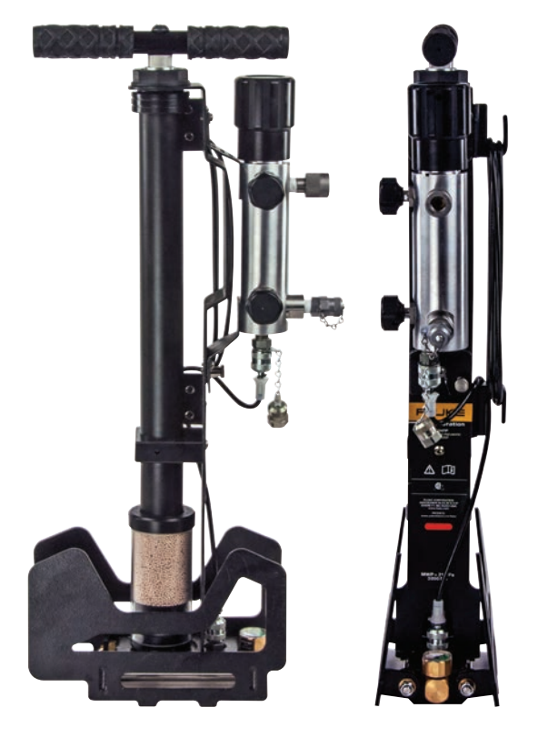
The 700HPPK features collapsible feet that make it easy to pack away.