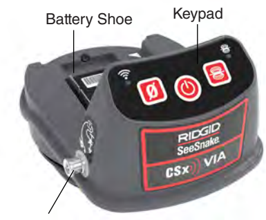
Transmitter Clip-On Terminal