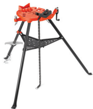
Model 460-12 Portable TRISTAND® Chain Vise Catalog No. 36278