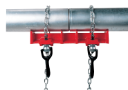
No. 461 Straight Pipe Welding Vise Catalog No. 40220