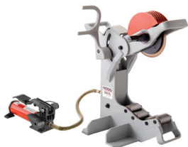
Model 258XL Power Pipe Cutter Catalog No. 58227