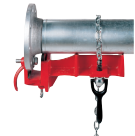
No. 464 Flange Pipe Welding Vise Catalog No. 40235