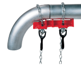
No. 463 Elbow Pipe Welding Vise Catalog No. 40230