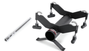
Catalog No. 55023