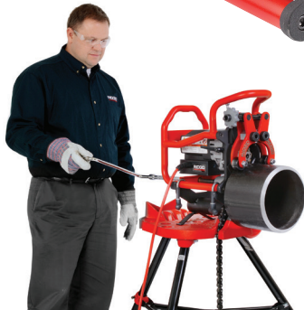
Beveller shown on TBM-36 Beveller Adapter (Cat. # 55023) for fixed bevelling.