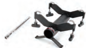
Catalog No. 55023