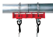
No. 461 Straight Pipe Welding Vise Catalog No. 40220