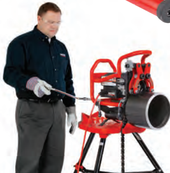
Beveller shown on TBM-36 Beveller Adapter (Cat. # 55023) for fixed bevelling.