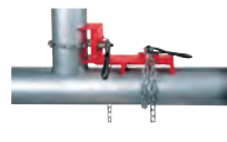
No. 462 Angle Pipe Welding Vise Catalog No. 40225