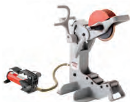
Model 258XL Power Pipe Cutter Catalog No. 58227