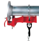
No. 464 Flange Pipe Welding Vise Catalog No. 40235