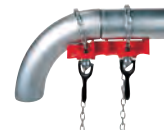
No. 463 Elbow Pipe Welding Vise Catalog No. 40230