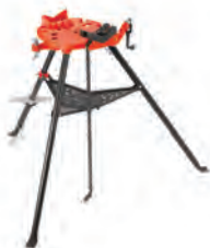
Model 460-12 Portable TRISTAND® Chain Vise Catalog No. 36278