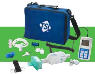
4070 High-flow test system with 4073 Oxygen sensor kit (sold separately)

TSI and the TSI Logo are registered trademarks of TSI Incorporated.