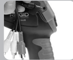
TV Out and RCA Cable