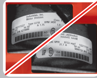
180° Digital Rotation