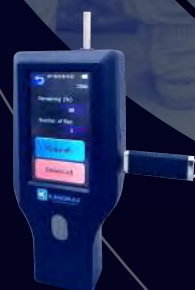
Sleek/Modern Instrument Design