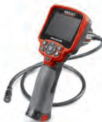
micro CA-300 Inspection Camera Catalog No. 37888