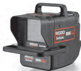
MINI Pak Monitor Catalog No. 32748