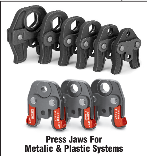
Press Jaws For Metalic & Plastic Systems