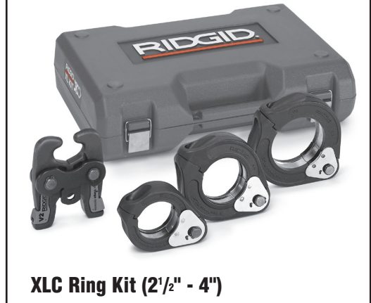
XLC Ring Kit (2 1/2" - 4")