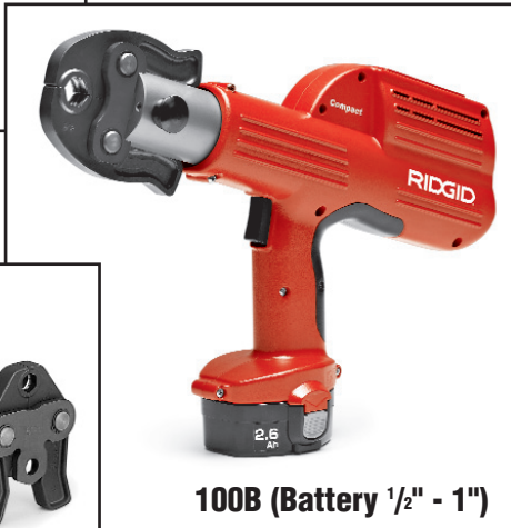
100B (Battery 1/2" - 1")