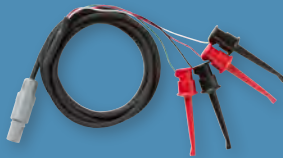
Universal RTD Adapter