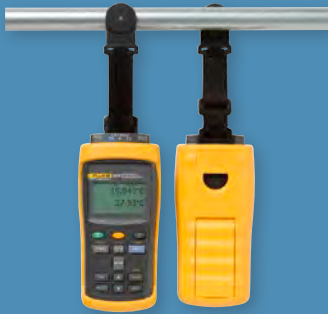
TPAK Magnetic Hanger