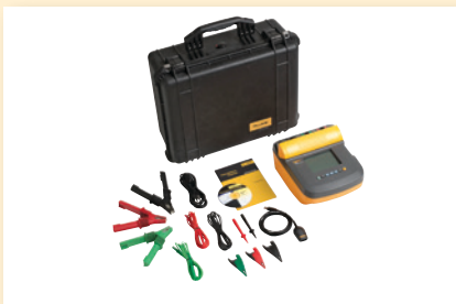
Fluke 1555 Insulation Resistance Tester Kit