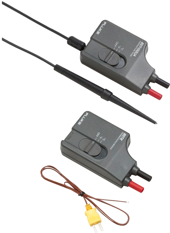
80TK Temperature Module and 80T-150UA Temperature Probe