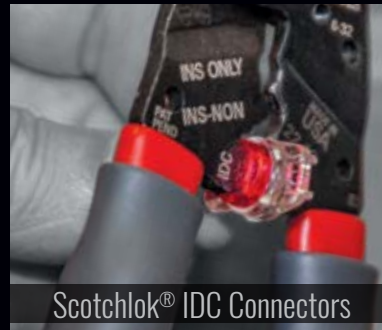
Scotchlok® IDC Connectors