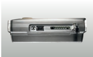
Lateral connection of Mini USB cable and SD card