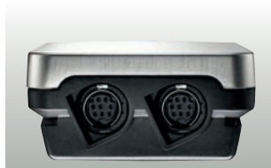
Probe connection at lower end of housing for two temperature/humidity probes