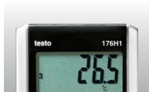
Large, clear display for showing measurement values